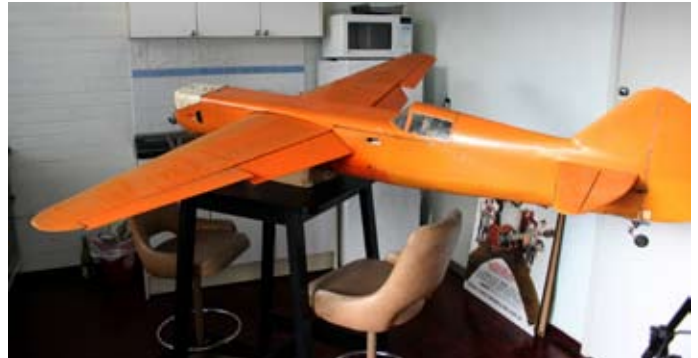
Mr Smoothie as back up

Lachlan's Show and Tell at primary school after calling for me in Team Texican at Adelaide 2005