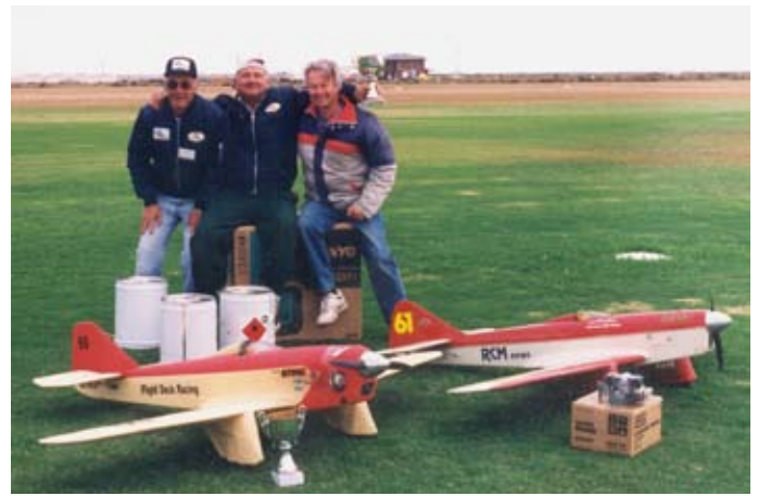
Aiming to go better than second and third