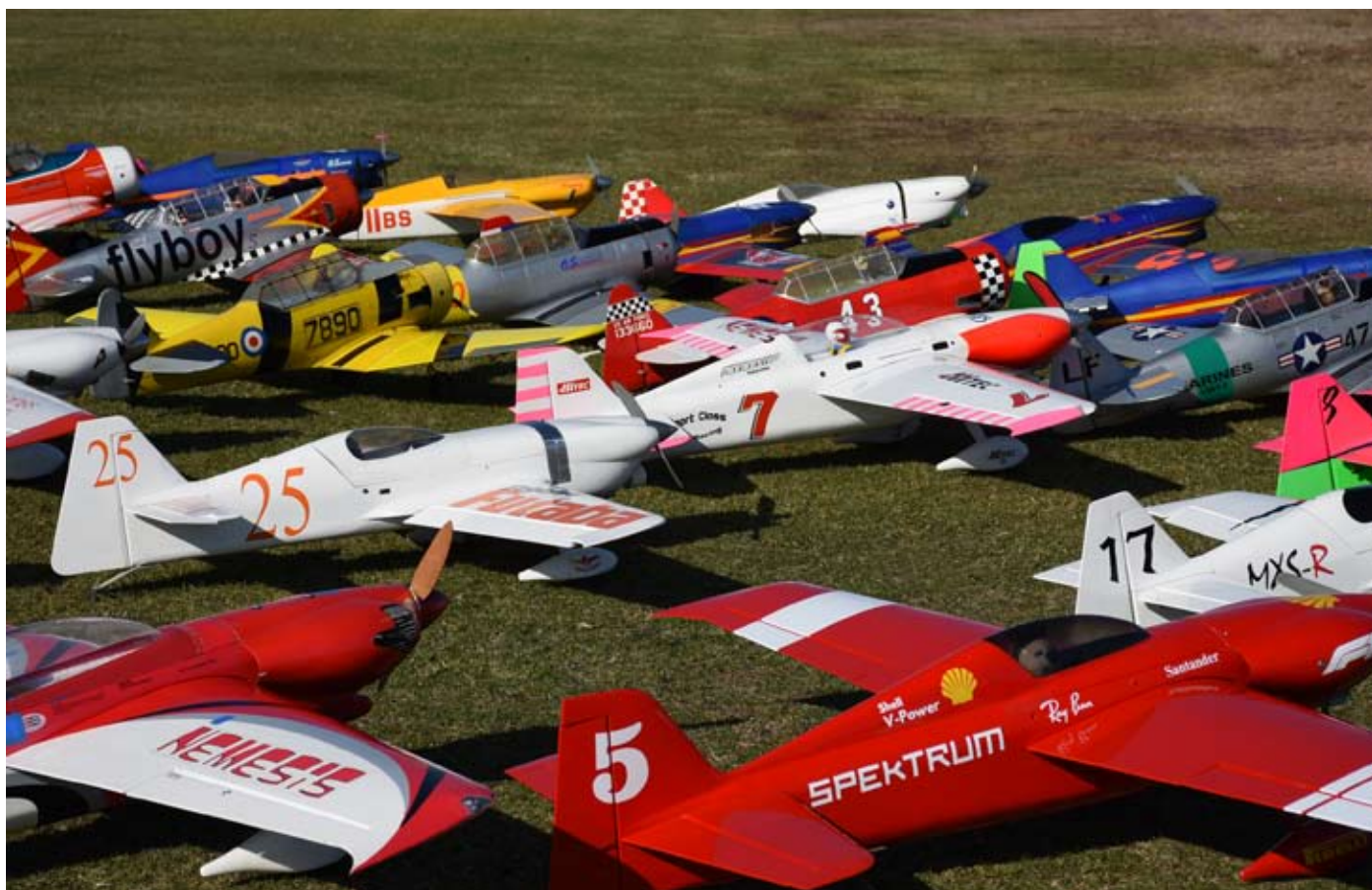
Round three Vic State Field Melbourne 2019

As much as I love racing it's important to remember every other aspect we enjoy in aeromodelling and to get out there and play with the rest of the toys too. In the mean time I'll be here looking forward to a little normality returning with being able to go racing next year.