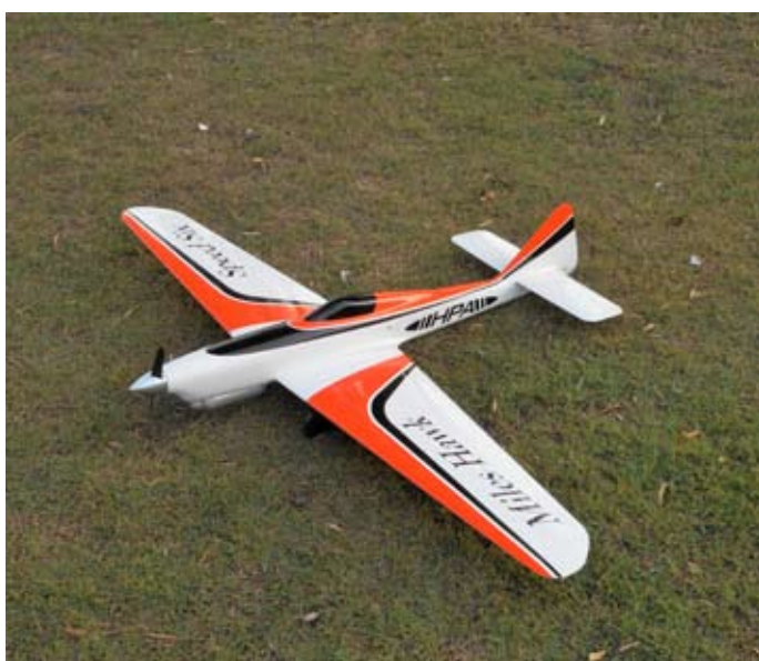
Harrod Performance Aircraft Q-40 F3T Miles Hawk