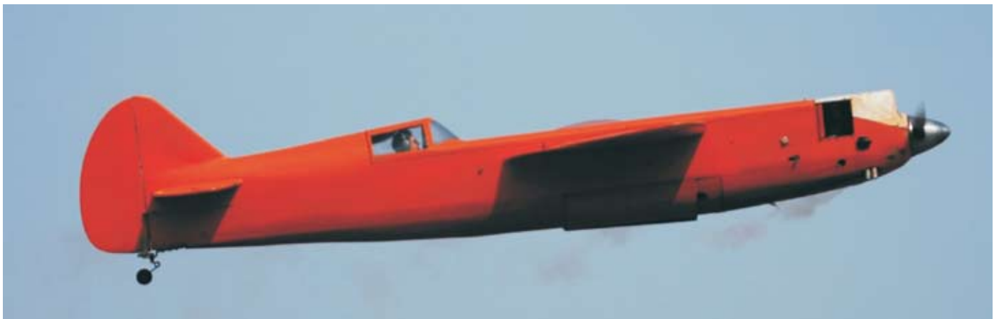
Gear doors blow off exceeding 250kph

The DA 85 is going into the Miles Hawk Speed 6. The model was ready to fly for Adelaide a few years back but the change