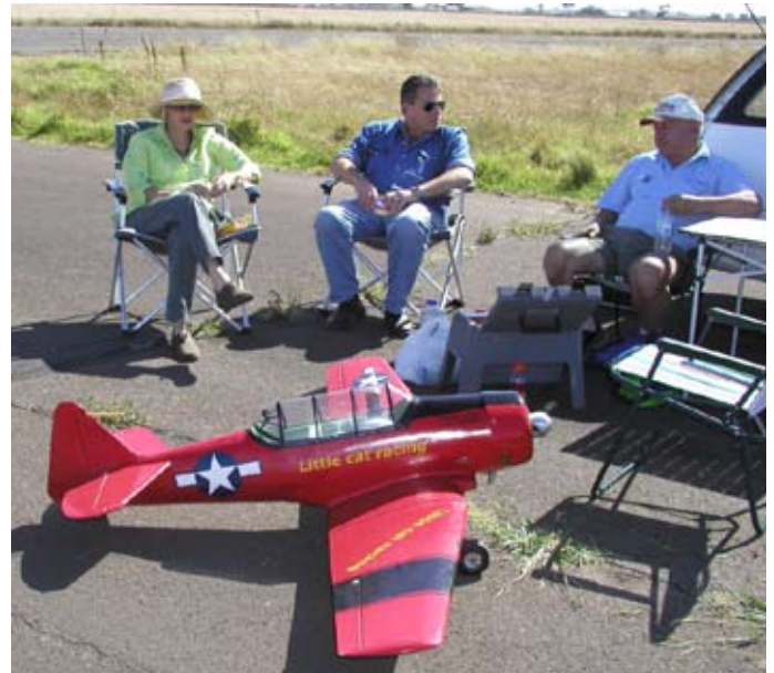
Little Cat with her Little Cat