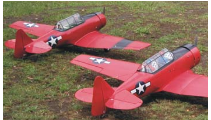
Midwest and CM Pro Texan - Little Cats 1 and 2