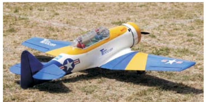
6.35kg CM Pro Texan Little Cat 3