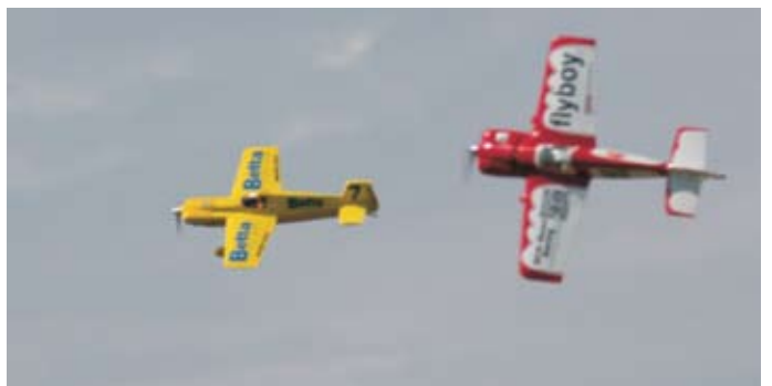
Affordable ARF racing is the best fun