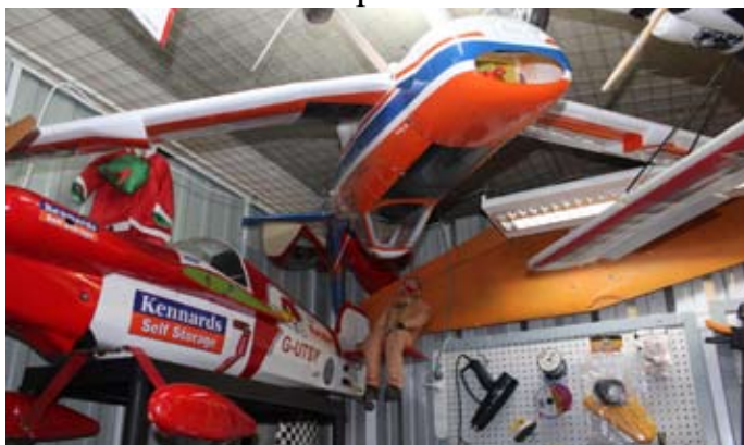
How long do I have to stare at this thing?

Before I get started on anything new there are a couple of my Dad's Golden Era in-line