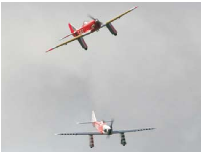
Sixty cc ARF Sparrowhawks

A few bulkheads coming adrift and the only problem ever with a fuselage, pictured above, was due to a propeller failure. If the spinner comes off in flight that is a Jettison. In case it damages the prop the plane must land straight away and a zero score is the result. We are not sure if the spinner let go when at 250 kph Paul Hewitson scooted past us on the way to Pylon 1. He lost sight of the