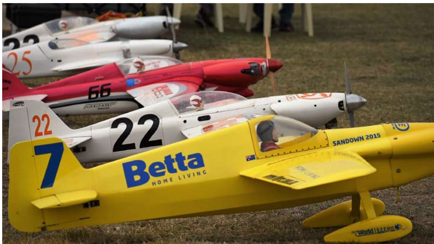
Keith’s Seagull Models Cassutt was one of the eleven Formula Ones

I’ve been racing a venerable Seagull Models Cassutt racer with a superb DLE 61 up front for the 60 cc F1 class and an equally capable Seagull Models Nemesis for the 35 cc F2 class running the DLE 35RA. Whilst the