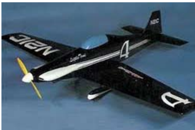
.25 size Pilot EZ Little Toni

Years ago in the VMAA Inter Club Trophy sport pylon category I knocked up an aluminium backplate engine mount to shoe horn a pumped OS 46 into a .25 size Pilot EZ Little Toni ARF. For a stir I used one of the .46s out of a twin engine camera model. The one with a left hand crank. Competitors were checking out the pusher prop wondering if I had come up with a better mousetrap but no one was game to ask. Finally one asked why.