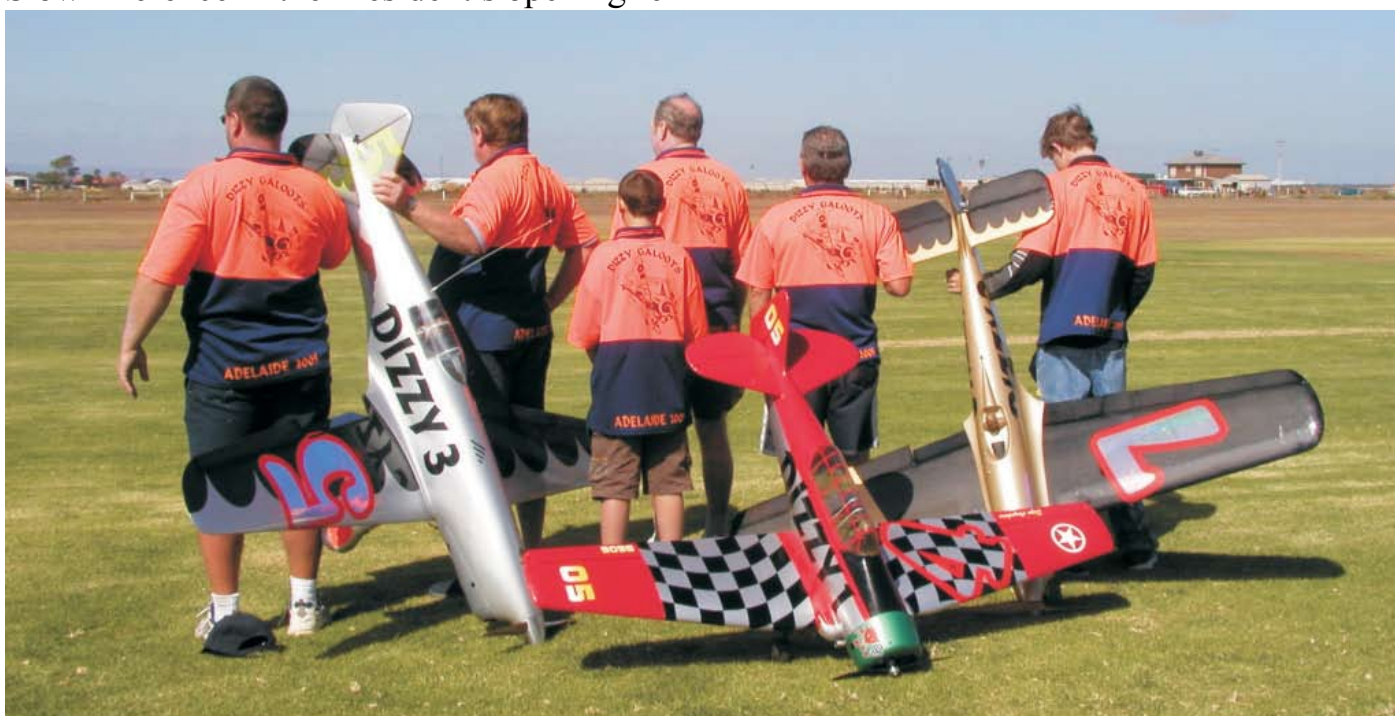
Team Dizzy first crack at the title