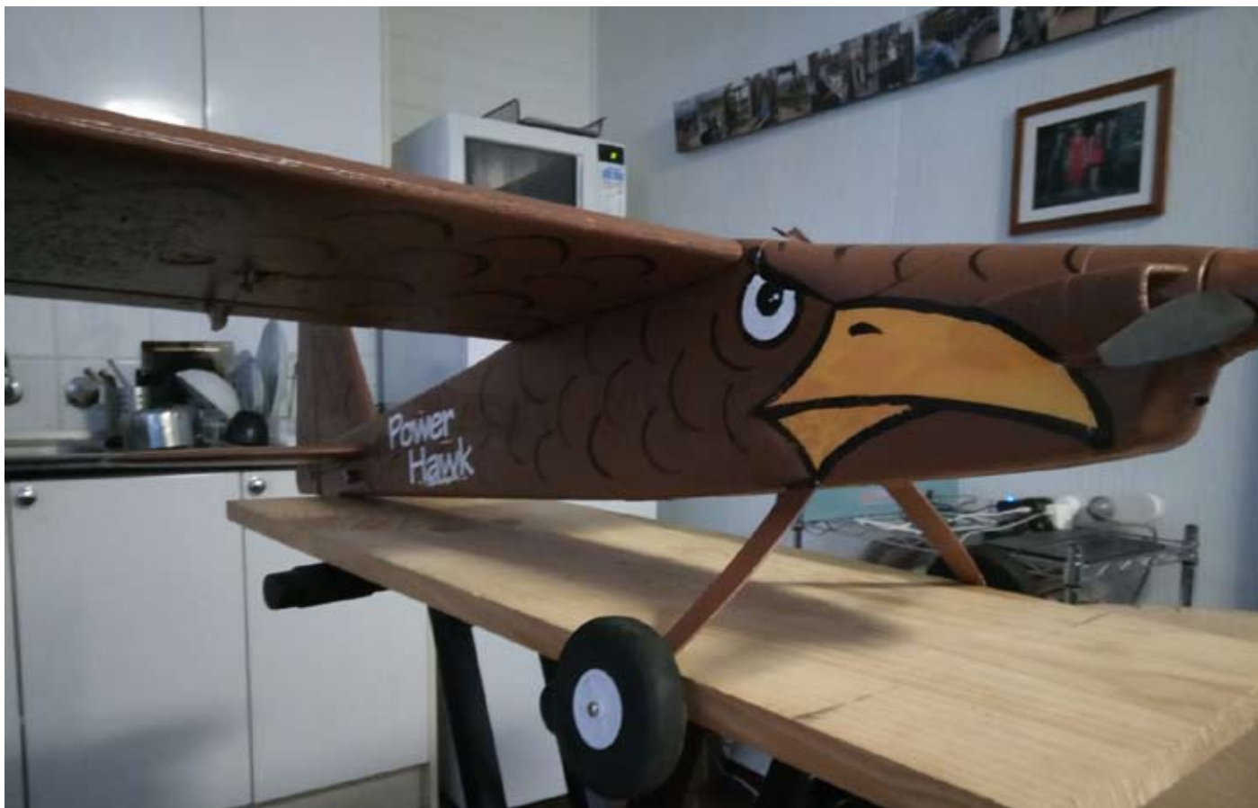
VICTORIAN MASCOT VERSION 2