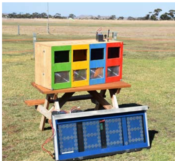
One of the two integrated pylon light timing scoring systems built by host club Northern Flying Group

The last racing event at the Victorian State Field (Northern Flying Group) saw a group of some 30 pilots racing together over the entire weekend. It is a busy schedule with little time between events if you fly two or more classes, usually five rounds flown in each event. If you are contemplating entering a few classes, you would be advised to limit