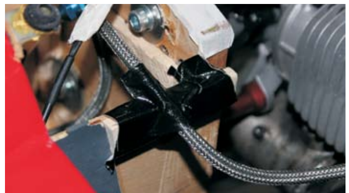
Prevent the spark plug lead from chafing

Many ARFs have soft sheeting so pick them up using a flat hand underneath. My thumb cracked the sheeting and this happened during a turn. Noticeably slower this knocked ten kph off the top speed