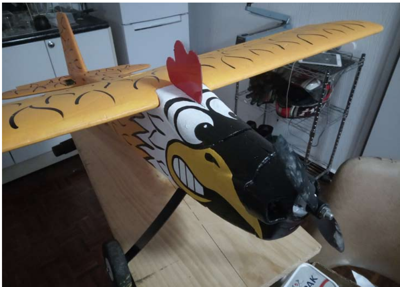
Formula 1 National Air Racing News