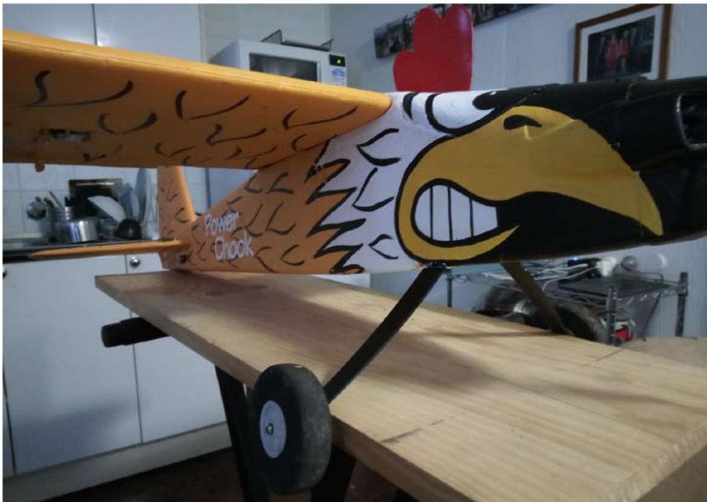
NSW MASCOT