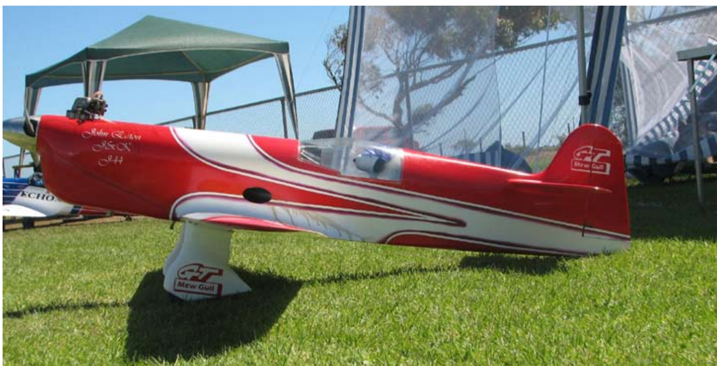
Karl Harrod completely smoked the opposition. Aerodynamic drag from the carburettor was not a problem