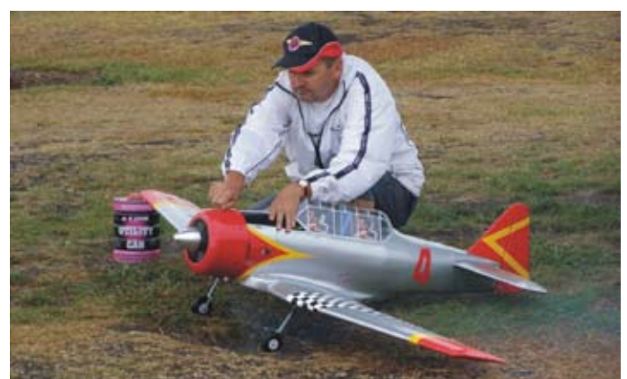
6.35 kg Seagull Texan 120 Little Cat 4