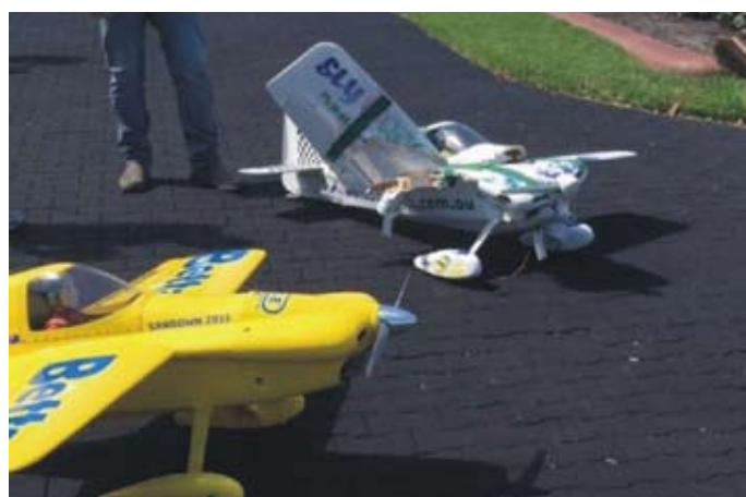
Failed scrutineering when it presented for Round 3

The model presented for Round 3 in the hope some Safety Nazi would photograph it on the startline, take the bait and complain. The