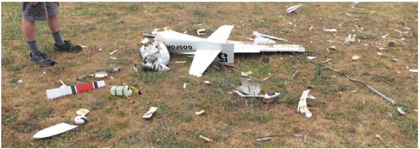
Prop threw a blade but there's a bit more to the story

other models circulated whilst the commentator built the drama of a baulky engine until we hit the countdown timer. Also that year the chap who was so much faster than the others started flying inverted to show off. So much so he received a rather generous helping of humble pie for his efforts.