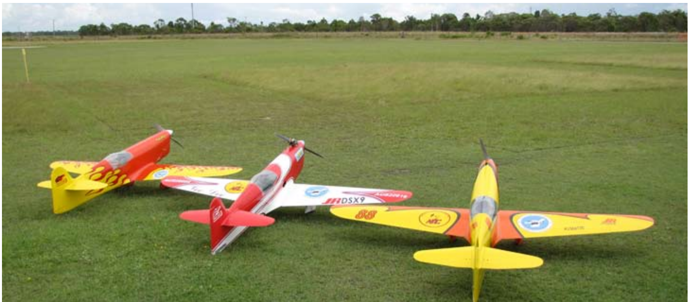
Harrod Performance Aircraft Team Queensland prior to setting off for South Australia