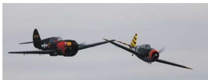
His Top Flite P-40 in new livery for 2012