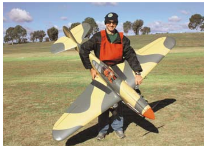
First time racing guess who took out Reno 2011?