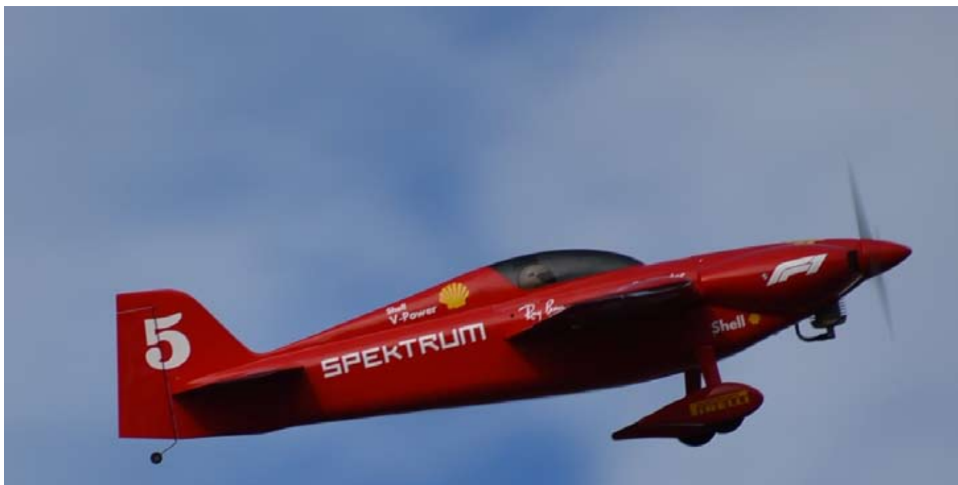
Red does go faster

model rounding the pylon. He was flying the Nemesis then was suddenly not flying the Nemesis. It vaporised after throwing a propeller blade. I don't want to drone on about it but smacking head on into a multicopter recording footage is hard on props. The bad news for F1 competitors is his latest painted Nemesis is red. Red it is and yes it is faster. Now that the hard yards have all been done