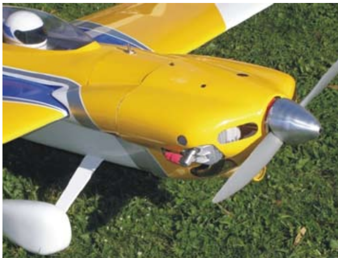
DA 50 in a Sundowner. Great looking plane but gets a bit wobbly through a tight turn