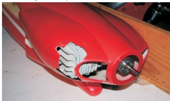
Big engine in a Nemesis extensively flight tested